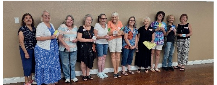
Bunco players are having a fun time!