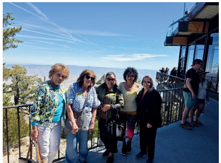
Friends "tripping" together with the Travel Club

Palm Springs Tram slowly rotates as you go up the Mountain.