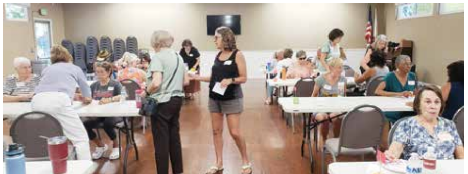
Switching tables for the next “round” of Bunco.

We hope to see you at the Sept. 25 game!