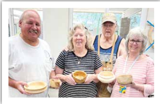
WOODSHOP GROUP P. 11