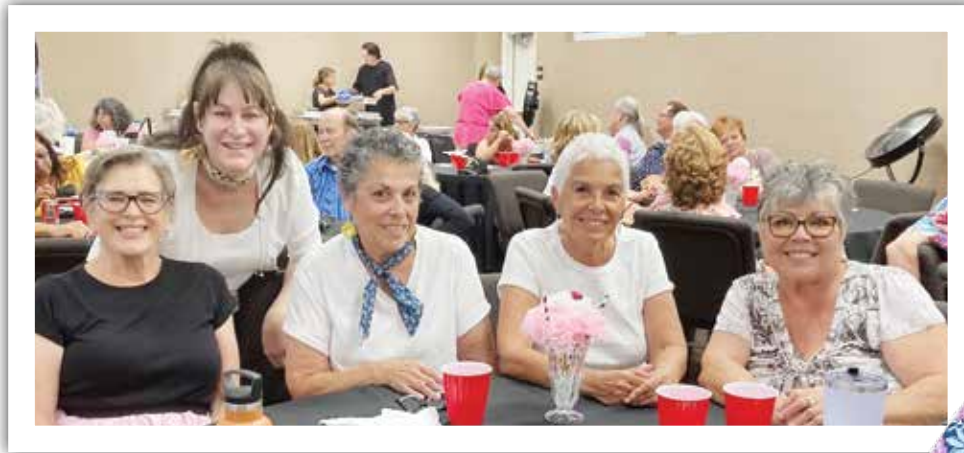
FUN AT THE SOCK HOP! P. 5