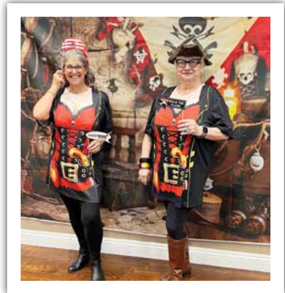
GARDEN CLUB P. 13