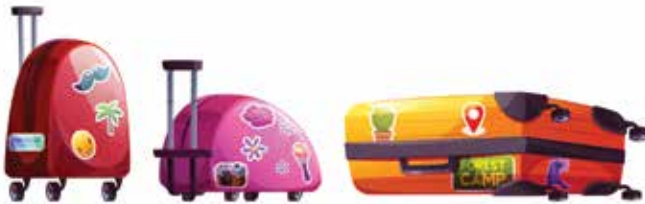
TRAVEL CLUB P. 14