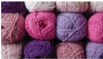
Senior Knitters & Crocheters of Meniffee