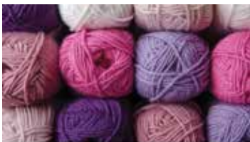
Senior Knitters & Crocheters of Menifee

Our Art Room is open for Art Gatherings on the third Friday of each month. Almost all art projects are welcome, but please, no solvents.