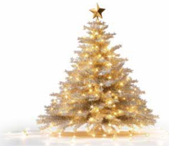
MENIFEE PULSE P. 9