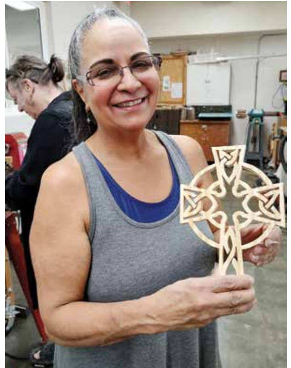
WOODSHOP GROUP P. 13