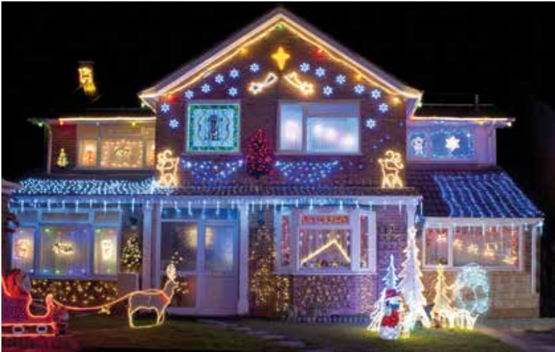
UPCOMING EVENTS P. 5